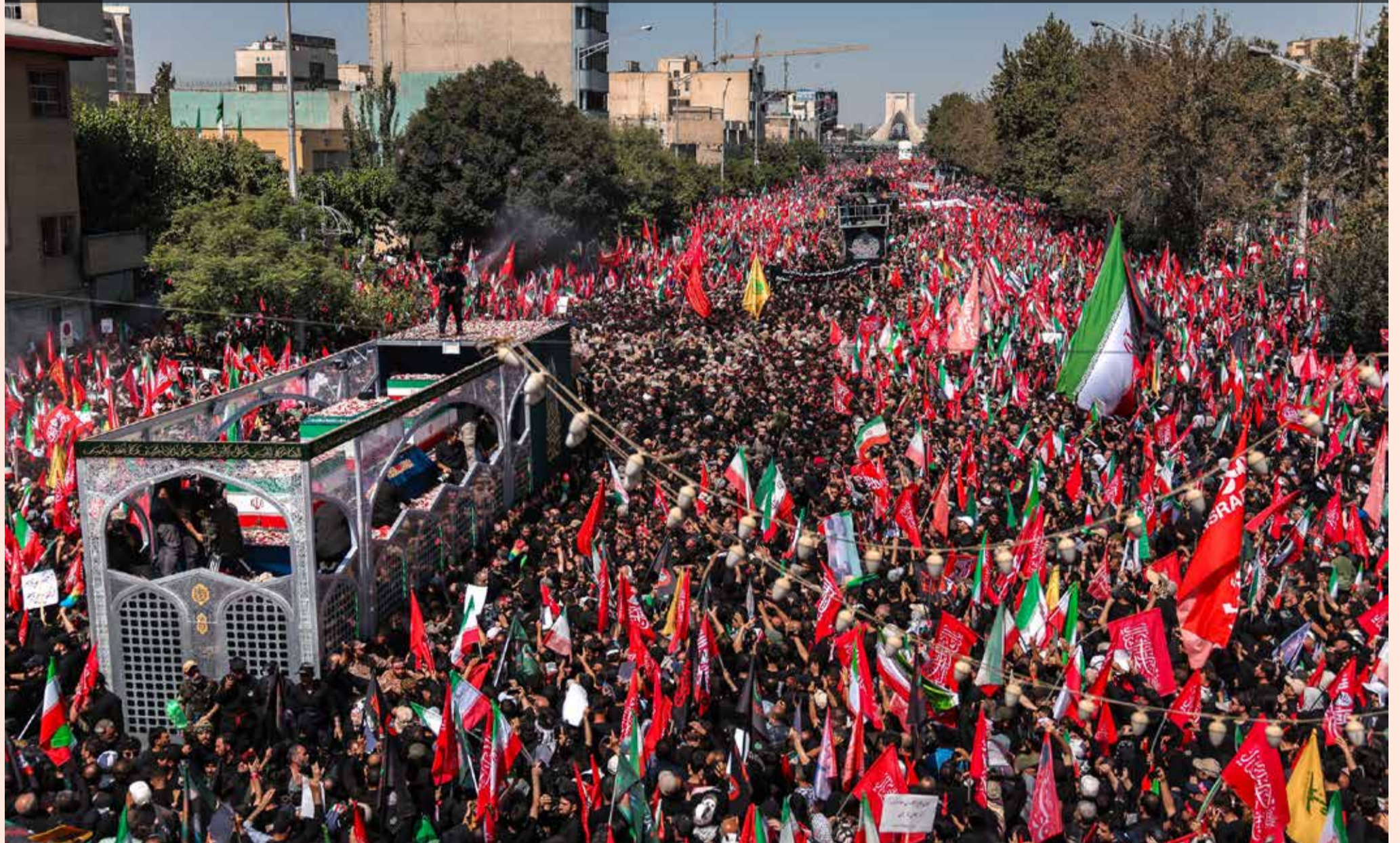
A vehicle carrying coffins of Ayatollah Seyyed Ali Khamenei and his family members makes its way as people attend a funeral procession for Iran's martyred Leader, who was assassinated on February 28 in Israeli and US airstrikes, in Tehran, Iran on July 6, 2026.