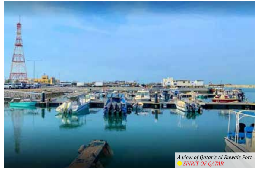
A view of Qatar's Al Ruwais Port

Dubai also welcomed the first flight from Tehran since the wartime suspension in late June, when a Sepehran Airlines flight landed at Dubai International Airport on June 30, marking the first direct service from the Iranian capital after the U.S.-Is-