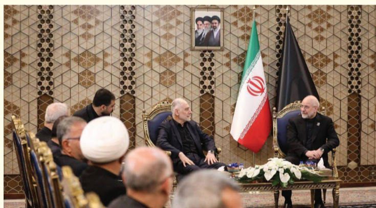
Iranian Parliament Speaker Mohammad Baqer Qalibaf (R) meets with a delegation of senior Hezbollah officials in Tehran on July 5, 2026.