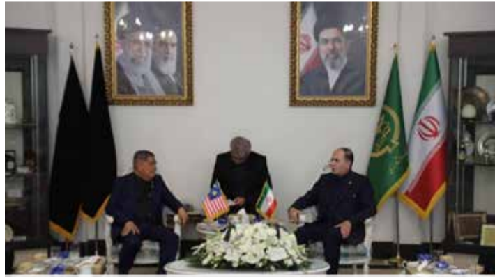
Iranian Agriculture Minister Gholamreza Nouri-Qezeljah (R) meets his Malaysian counterpart, Datuk Seri Mohamad Sabu, in Tehran on July 4, 2026.