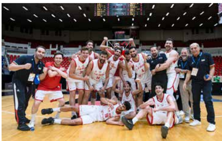
Iranian national basketball team players and coaching staff celebrate a victory over Syria in the FIBA World Cup Asian Qualifiers in Amman, Jordan, on July 5, 2026.

The federation concluded by pledging greater planning, supervision, and accountability as it seeks to address weaknesses and prepare the national team to challenge for the world title, stressing that all decisions will be made solely in the interests of Iranian wrestling.