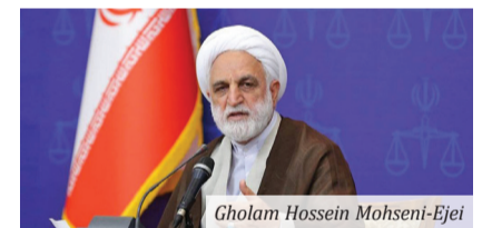
Gholam Hossein Mohseni-Ejei

The decree concludes with prayers for the