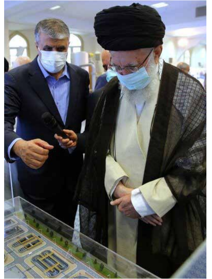
Late Leader of the Islamic Revolution Ayatollah Seyyed Ali Khamenei (R) visits Iran's nuclear achievements as the head of the Iranian nuclear organization, Mohammad Eslami (L), accompanies him in his visit in June 2023.